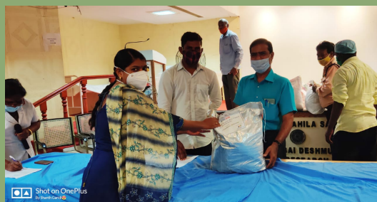
Hundred hygiene and ration kits distributed at Durgabhai Deshmukh Hospital