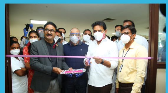
Inauguration of 150 ICU beds in TIMS by honourable minister KT Rama Rao

“They have been providing us excellent support in running this institution. With the help of Nirmaan - HYSEA we have been able to get certain contributions to the institution which have helped us tremendously in providing quality patient care as well as ICU care for the patients admitted here.”