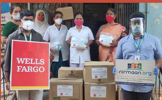
Donating Home Isolation Kits in Rural areas