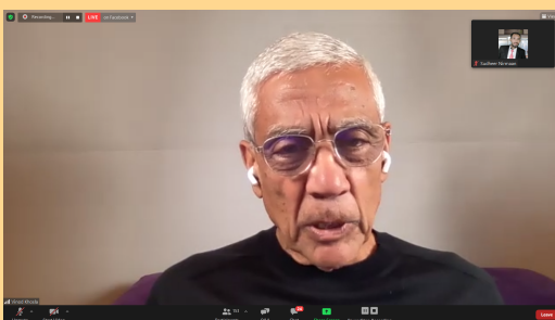
Shri K.T.Rama Rao and Vinod Khosla extending their support towards the program

10-Bed-ICU, a PPP (private-public-partnership) project between Govt. of Telangana and a group of NGOs under the banner 10-Bed-ICU, launched the first critical care ICU unit in the Narayanpet district of Telangana. The goal of the 10-Bed-ICU project is to cover every district in India with at least one 10-Bed-ICU facility to combat Covid waves in rural India.