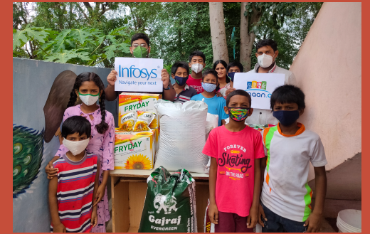
Distribution of survival kits at Orphanages