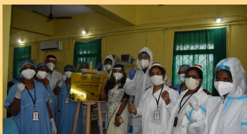
Nirmaan team at District Hospital, Narayanpet

Vinod Khosla who has already funded several 10-Bed-ICUs in Telangana, announced at the launch event that he will further fund 100 more district hospitals with 10-Bed-ICU across the country.