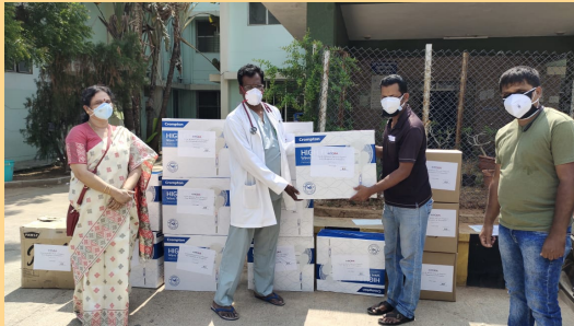
Leading from the front lines and delivering critical and immediate support at Kondapur district Hospital and TIMS Hospital