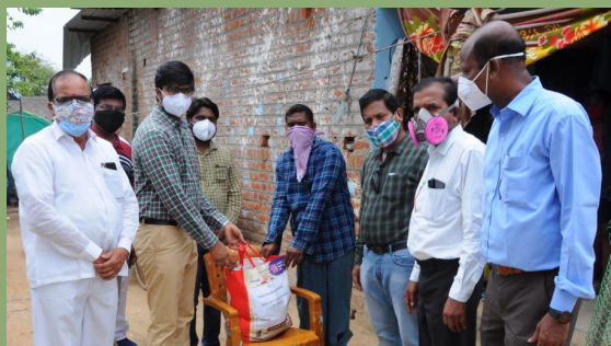
Nirmaan Team distributing Ration Kits