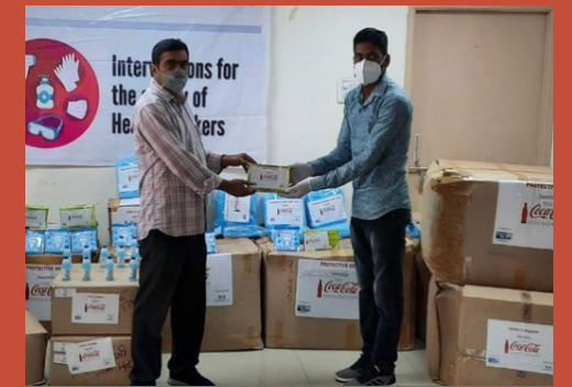
Delivering safety items to front line workers