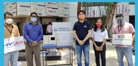
Glimpses at distribution of medical paraphernalia