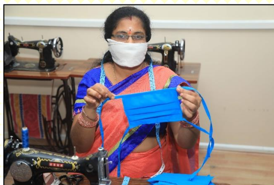
Women trainees at Nirmaan Vocational Training Center engaged in mask making activity