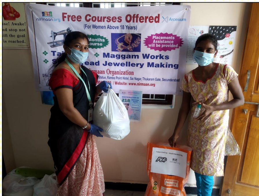
Ration & Hygiene Kit Distribution at Nirmaan Vocational Training Center, Addagutta, Hyderabad

The families identified are majorly migrants from other states and those who don't hold ration cards and thus unable to get benefited under govt schemes during lockdown. They stay in Manger Basti (slums) and Mondibanda nagar in Addagutta. The beneficiaries felt happy upon receiving the kits.