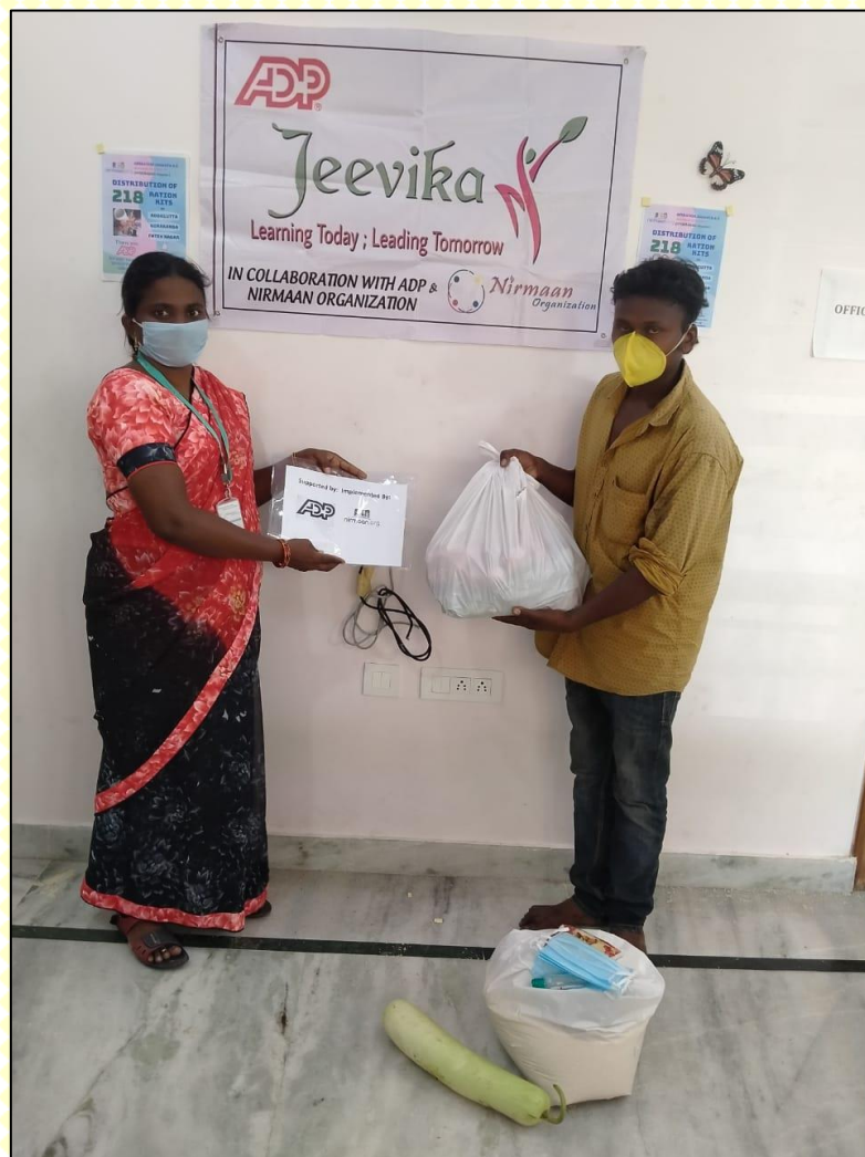
Ration & Hygiene Kit Distribution at Nirmaan Vocational Training Center, Borabanda, Hyderabad