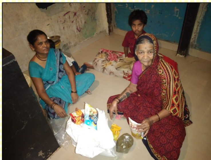
Beneficiaries with Ration & Hygiene Kits in Pune, Maharashtra