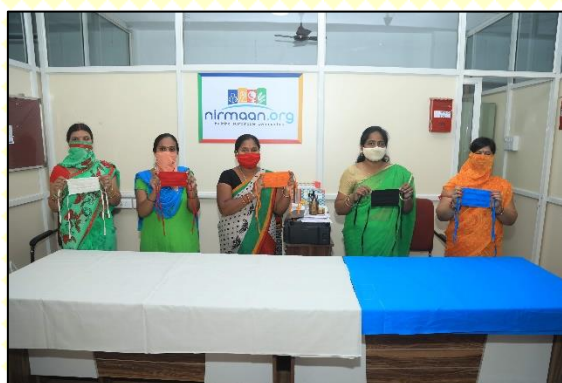
Masks made by trainees at display